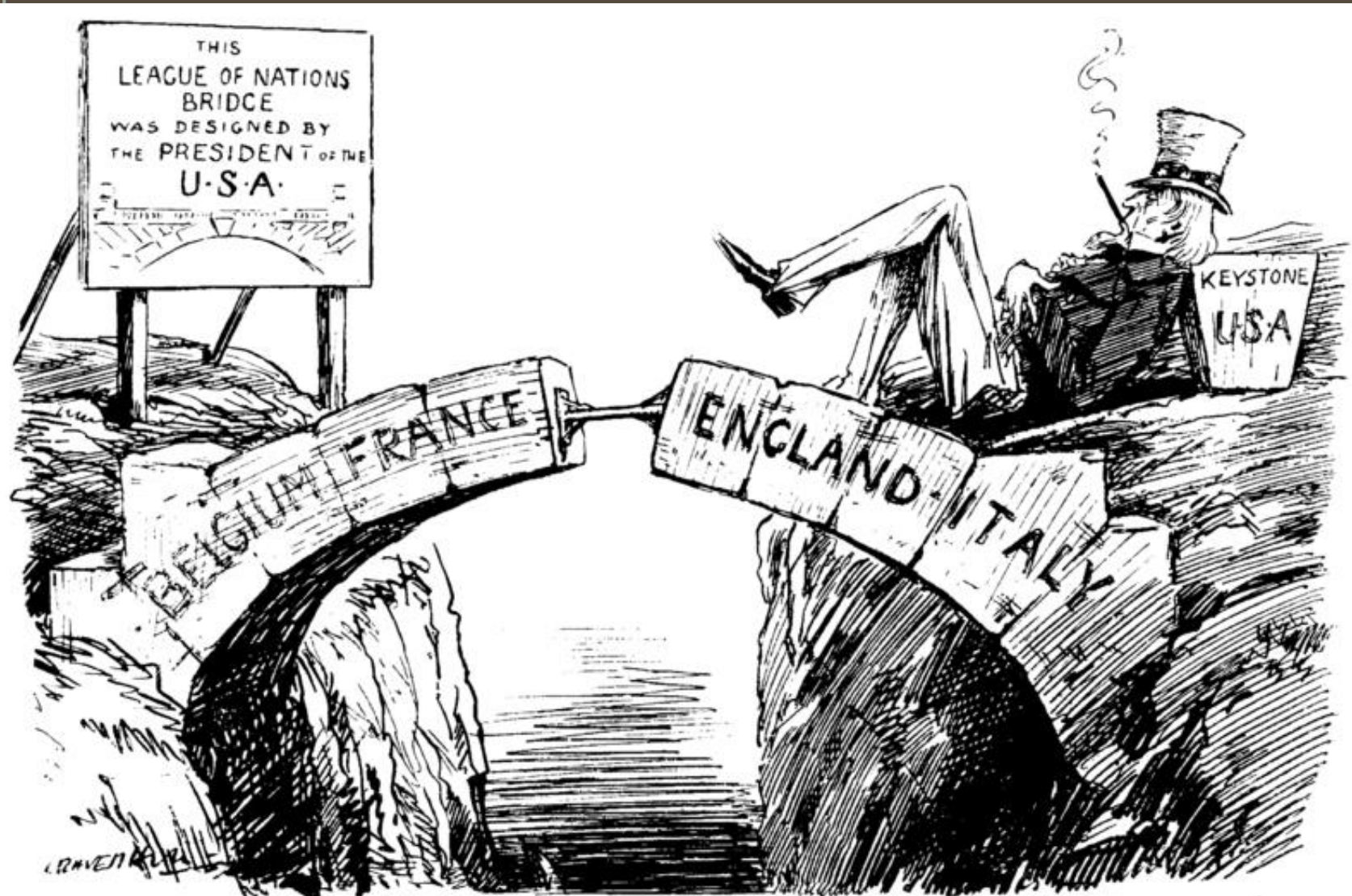
THE GAP IN THE BRIDGE.